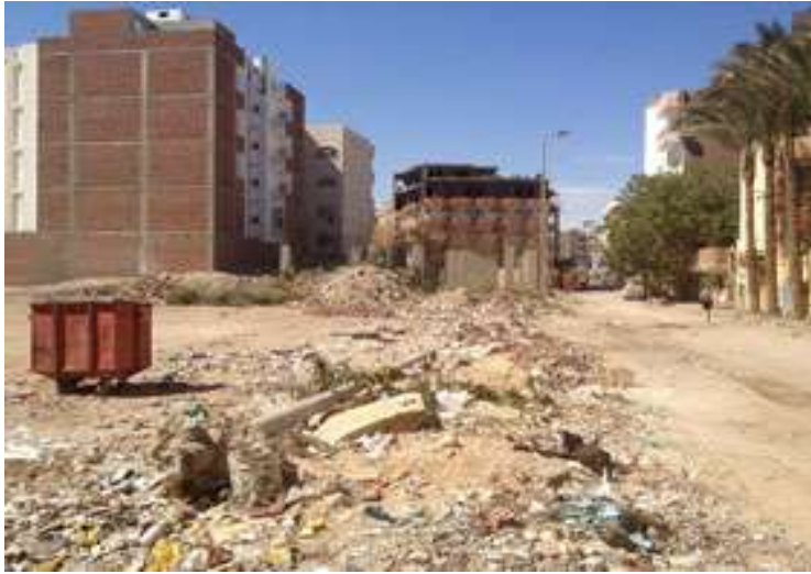
Tourists and construction side by side