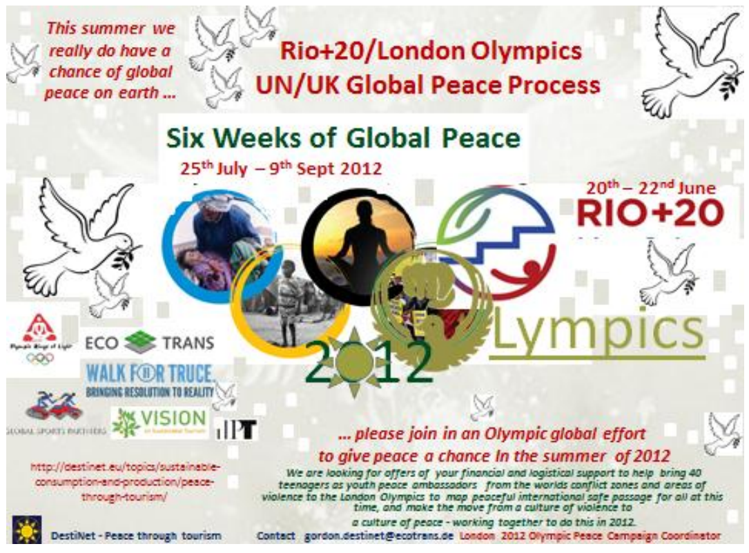
This report can be found at

\frac{http://destinet.eu/topics/sustainable-consumption-production-and-tourism-overarching/copy\_of\_peace-through-burism/london-2012-olympic-peace-campaign/