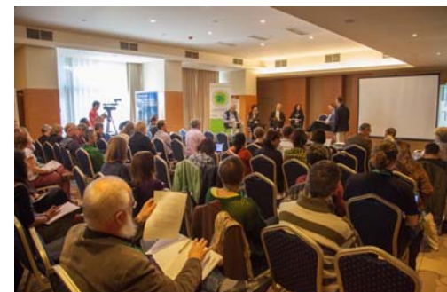
A view from one of the plenary sessions of the conference

It was agreed by all that the quality of the visitors' experience depends on good interpretation and appropriate information offered to them. It also depends on the quality of some main 'ingredients' of an ecotourism destination (well-preserved nature and culture, active community,