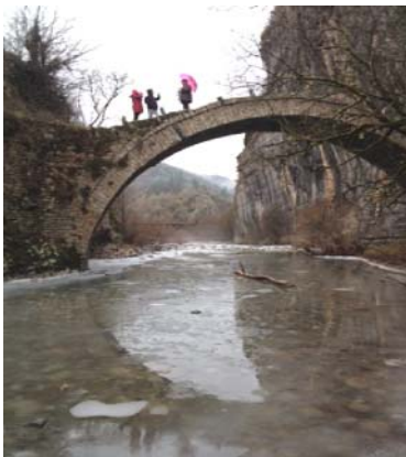
Ecotourists gaze at a frozen river in Zagori mountains, Greece

Let's wish a great success to this promising initiative!