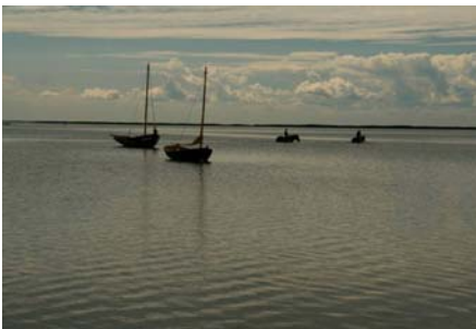
Ecotourism in Estonia, Vormsi island - Tarmo Pilving