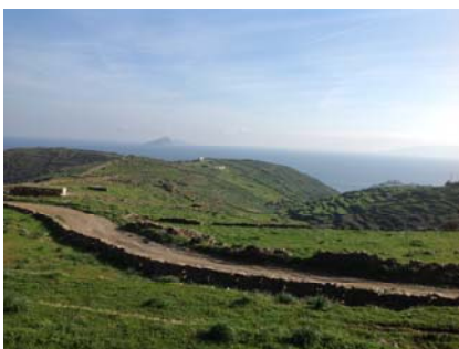
Ecotourists visit the Greek islands during the winter – magic at Kythnos