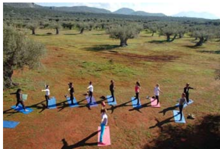
Ecotourism in Greece - Eumelia Agrotourism & Guesthouse

Photos can be found on EEN's online community: http://ecolnet.ning.com/photo/album/list