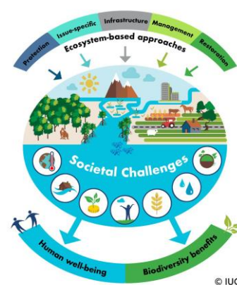
Fig 1 IUCN' s Ecosystem-based approach to societal challenges

Being old enough to have been following the turgid process of the empirical development of territorial sustainability indicators since 1996, I recognise the contemporary and timely importance of the formulation of this standard to support the much-needed value system of responsibility and sustainability that is the foundation of our common global sustainable development agenda. A management tool has arrived to give us the means to genuinely deliver the SDG goals whenever we need to undertake mitigation and adaptation measures that involve spatial planning, infrastructure development or landscape management. The tourism sector, especially destination policy makers, spatial planners and both public and private sector developers, should take advantage of this ground-breaking body of work on