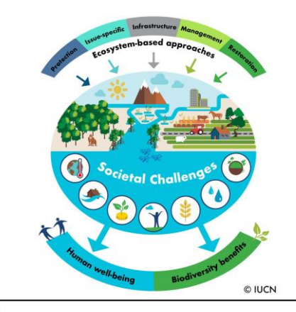
Fig 1 IUCN's Ecosystem-based approach to societal challenges

It gives us all a structured process to benchmark responsible stakeholder territorial interventions so we can face up to the current multiple challenges civil society, businesses and governments alike need to deal with - in partnership and in full knowledge of how to be sustainable and responsible at a time when