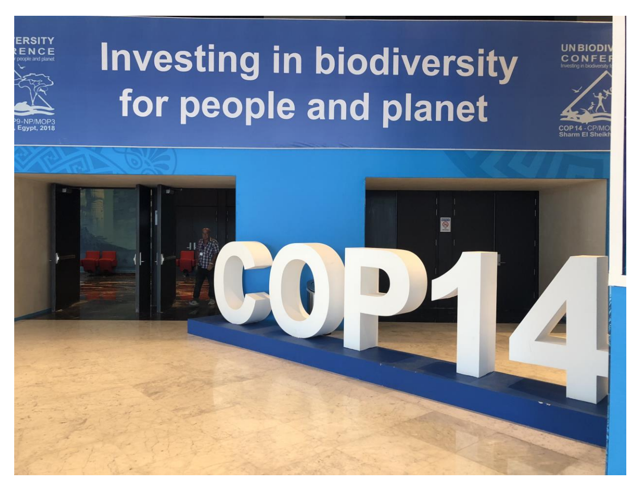
It's a fair CoP ... Land use change brought about by corporates and government actions - ie business activities in national territories - will destroy up to 70% of species we know today.