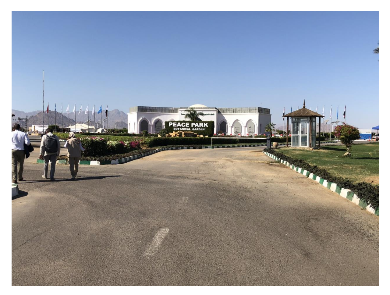
Peace Park, Sharm el Sheik, A CoP14 feature with a message for the future

So where does that leave those who still believe that our children can enjoy what past generations have been able to use to enrichen their live, instead of leaving them to inherit a hot, crowded, concrete monoculture and having to pay off the burden of economic, environmental and cultural indebtedness we place on them by our current cut-throat approach to material accumulation and mass consumption? Once again, it is easy to point out the problems but much harder to work out practical solutions. It will take a sea change at many levels in order to halt the loss of biodiversity in the next decade, or 'bend the curve' in the contemporary language of those in the know, but the single biggest change has to be in the value system of our collective consciousness, as the current awareness of the plastics issue proves.